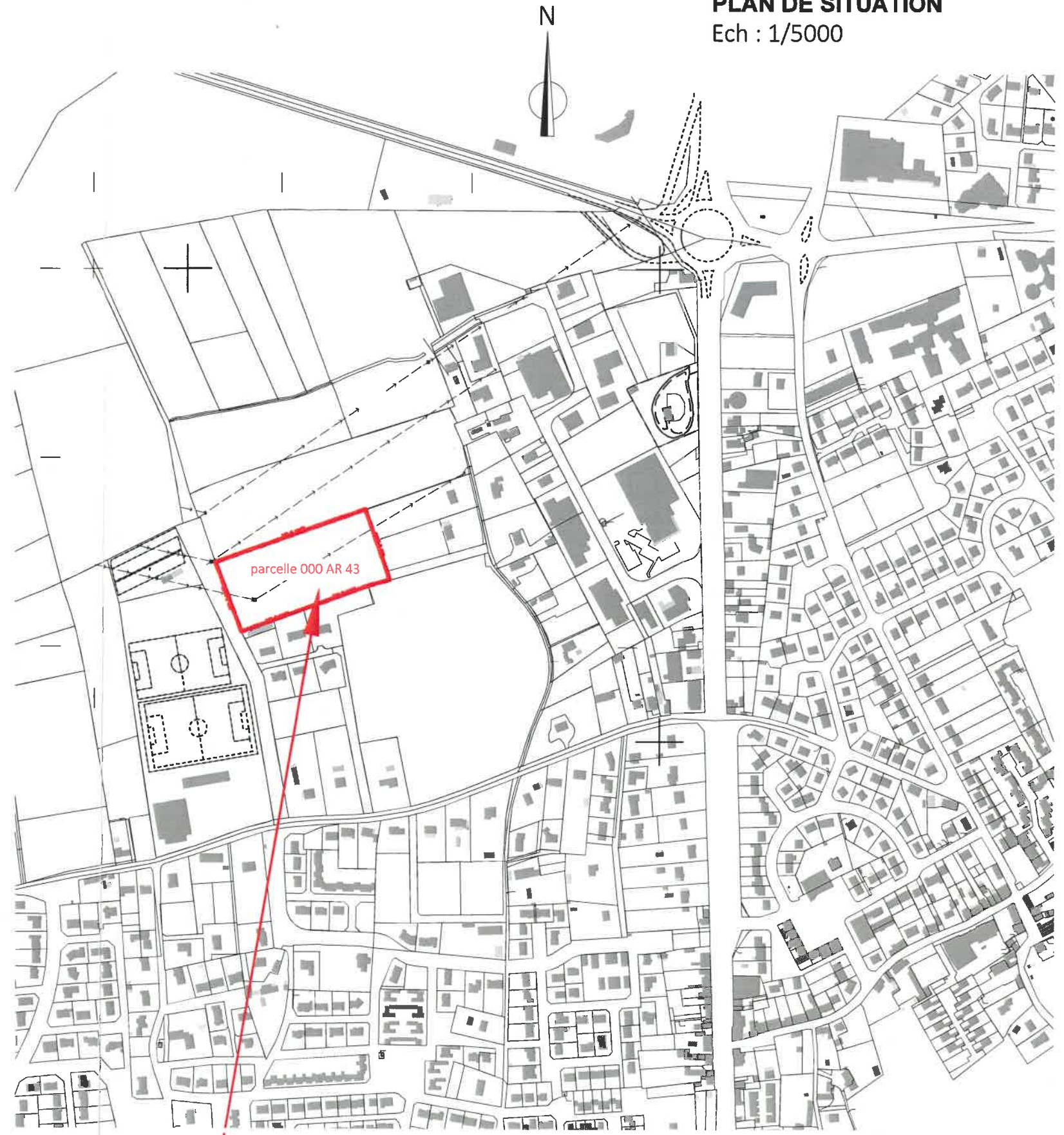
PLAN DE SITUATION Ech : 1/5000